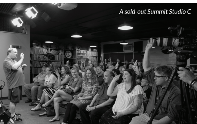
A sold-out Summit Studio C

The Summit FM, as part of Akron Public Schools, is a non-profit organization. Some underwriters consider their contribution to be an advertising expense, while others use it as a charitable donation. Ask your tax professional about the benefits of marketing your organization using non-commercial public radio.